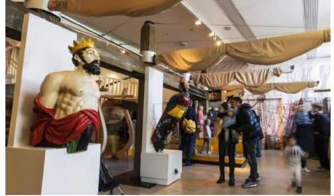
I can play in the All Hands gallery