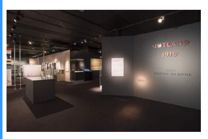
The Jutland gallery