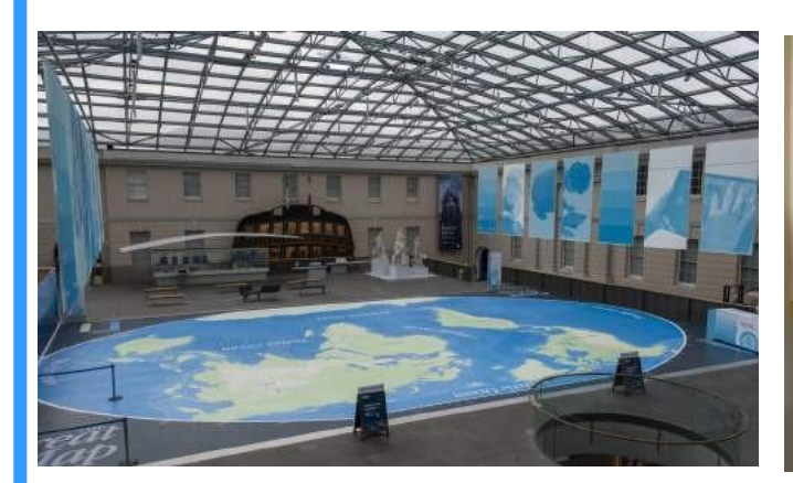
I can play on the Great Map