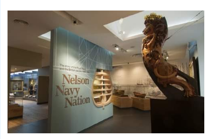
The Nelson, Navy, Nation gallery