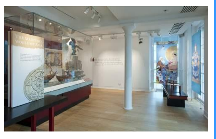
The Traders gallery