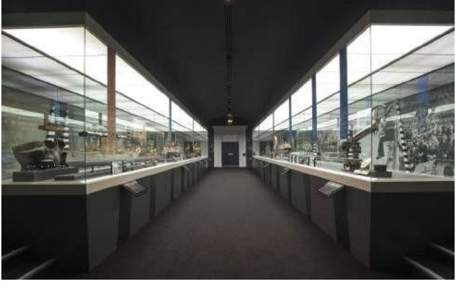
The Forgotten Fighters gallery