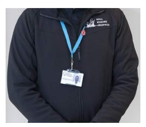
Someone in black