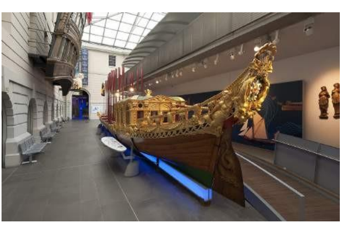
Prince Frederick's Barge