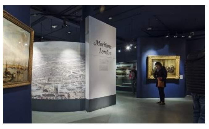
The Maritime London gallery