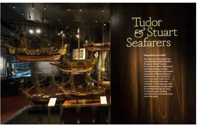
Tudor and Stuart Seafarers