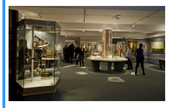
The Atlantic gallery