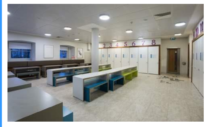
I can eat my packed lunch in the Group Space by the Romney Road entrance.