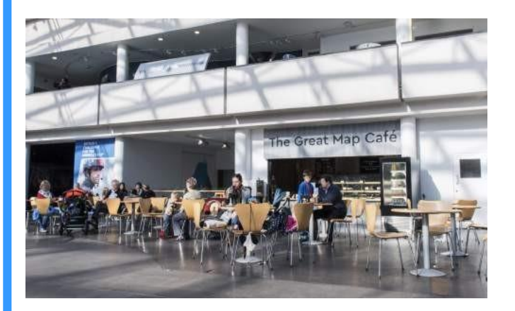
I can eat in the Great Map café