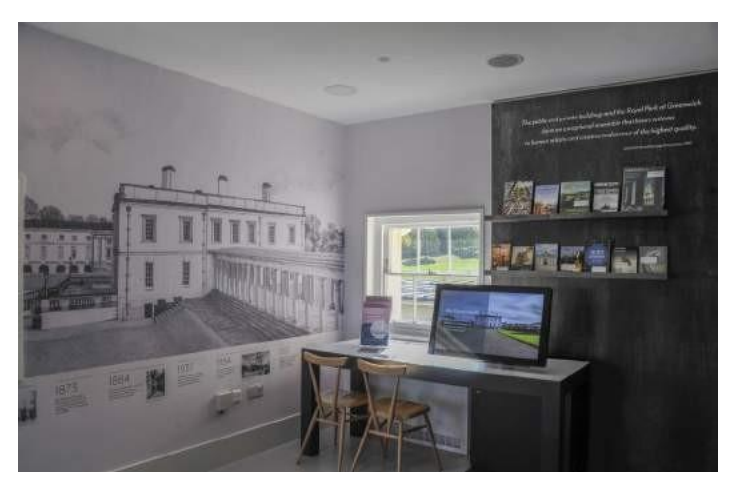
Go to My Greenwich on the second floor