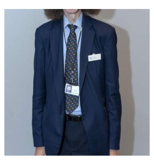
Someone in blue