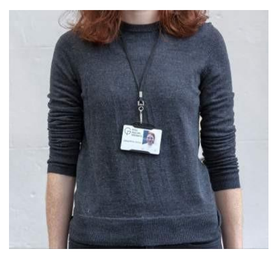
Everyone who works at the Museum wears a badge!