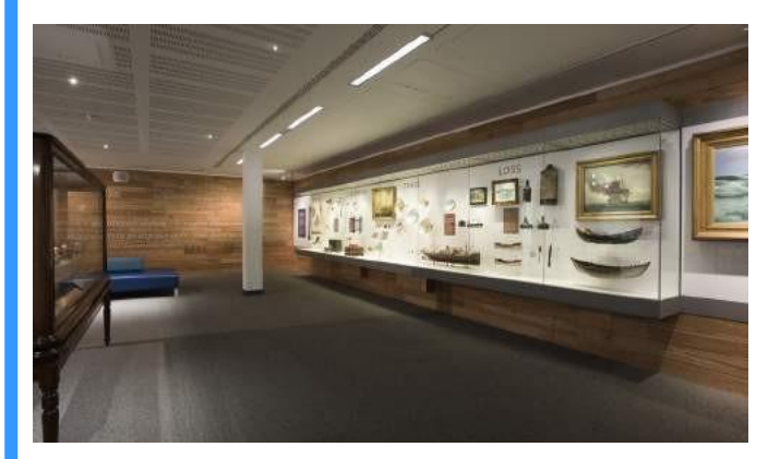
The Voyagers gallery