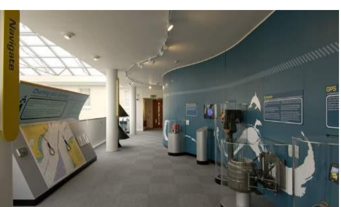
I can play on the Bridge