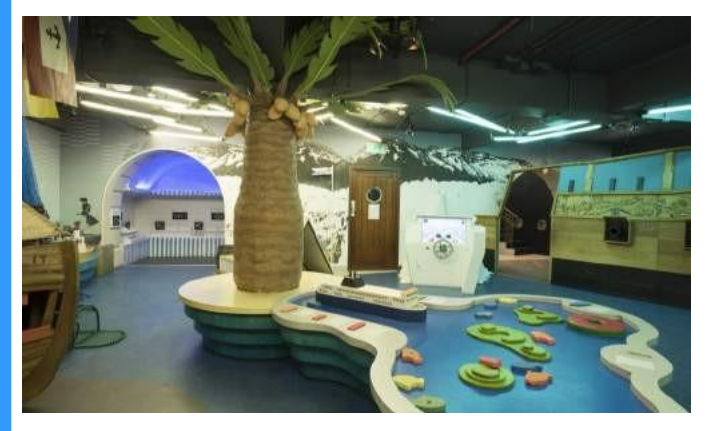
I can play in the AHOY gallery