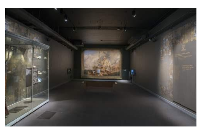
The Turner gallery