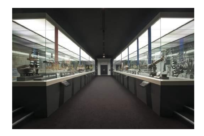
Go to the Forgotten Fighters gallery on the second floor