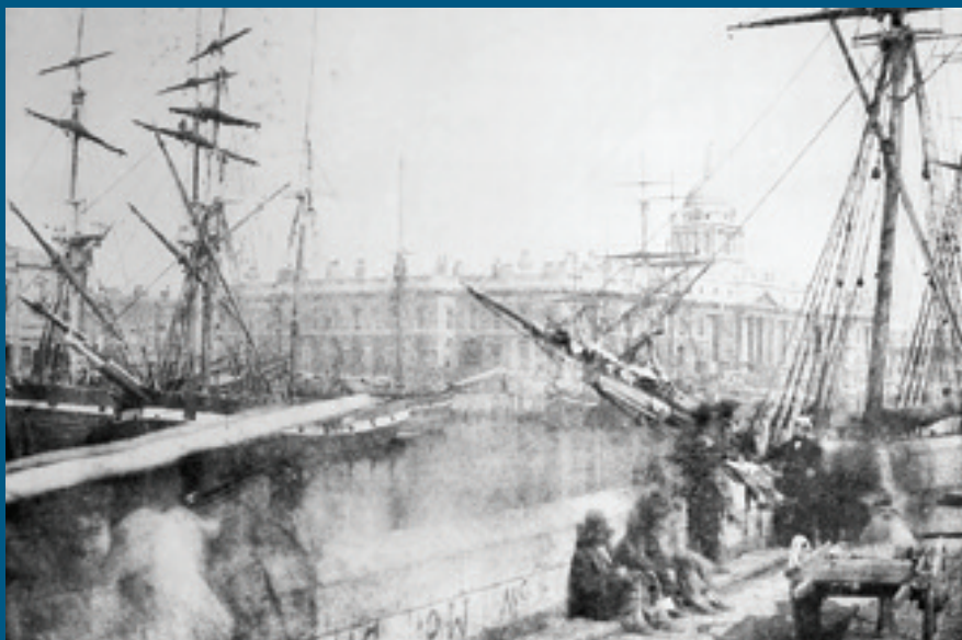
Image: Shipping on the river at Greenwich Reproduction. About 1890s. Maker: unknown.