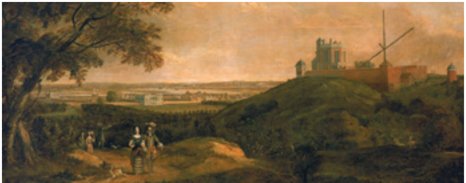
Image: Royal Observatory from Crooms Hill, circa 1680 showing Flamsteed's mast telescope.