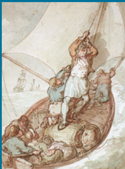
Image: Hoisting sail in a boat by Thomas Rowlandson.