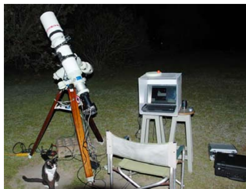
Ready to catch a comet

Read astronomical magazines and contact your local astronomy club to research information about the date, time and position of visiting comets. When you know the time and approximate location of a comet, set up your tripod to give an uninterrupted view of that part of the sky – the later after the end of twilight and the further away from city lights the better.