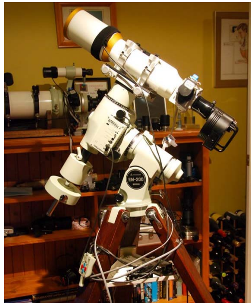
My 90 mm refractor telescope with astronomical CCD camera

If a comet appears large enough in the sky you can get great shots with a handheld SLR and a 300 mm telephoto lens. For the best images you need an astronomical telescope (of 500 mm focal length or more) and a cooled charge coupled device (CCD) camera. I use a colour CCD attached to a small 90 mm apochromatic (APO) refractor telescope with a polar-aligned equatorial mount.