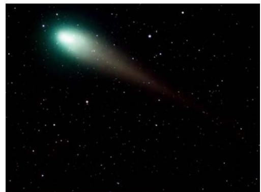
Four stacked and processed shots of Comet Lulin make a unique image. The magnificent green colour is caused by gaseous diatomic carbon in its local atmosphere, which glows green when illuminated by sunlight in the vacuum of space

The Royal Observatory Greenwich would like to thank