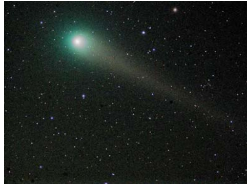
A single 180 second exposure of Comet Lulin showing excessive background noise before subtracting dark frames

Processing to me is magical. It can often take longer than the set-up and capture of your starting images but I find it the most rewarding stage of photographing comets.