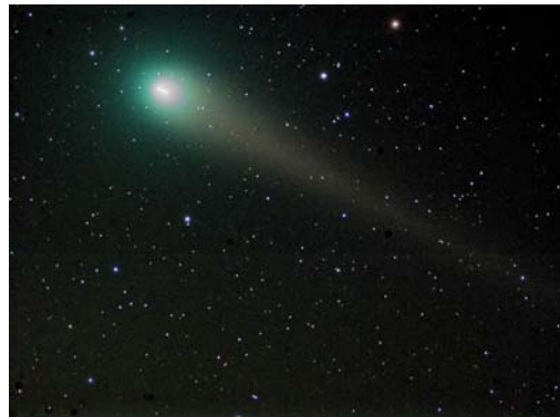
A much improved 600 second exposure of Comet Lulin before processing