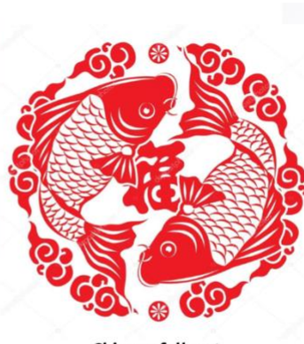
Chinese folk art Paper cut