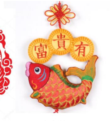
Typical Chinese New Year Decoration

This activity is for children to learn about the symbolic meaning of fish in Chinese culture and create their own lucky fish poster to celebrate the start of Chinese Lunar New Year.