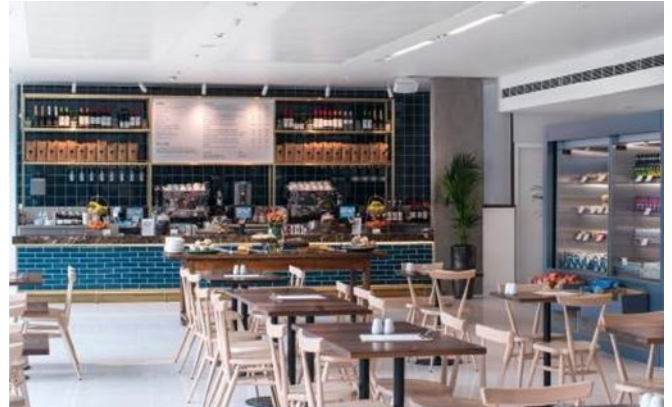
You can eat in the Parkside Café on the ground floor.