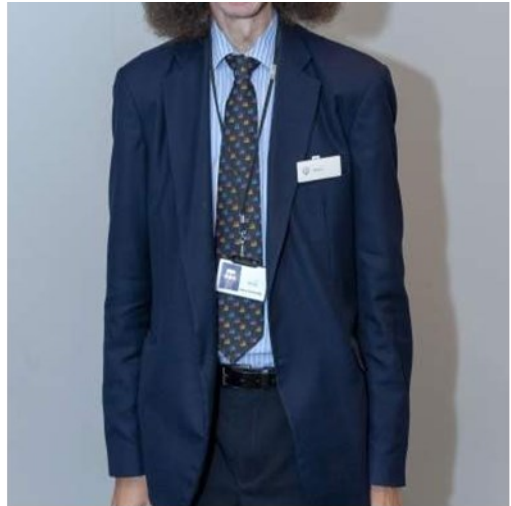
Someone in a blue shirt