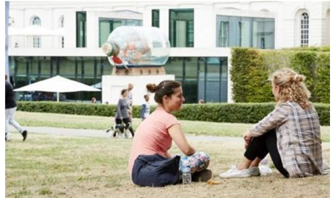
You can eat in the park