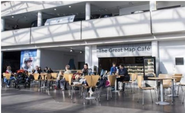
You can eat (including picnics) in the Great Map Café on level 1.