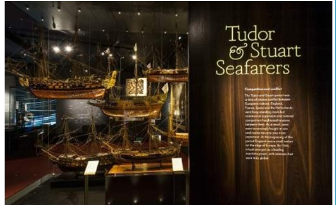
Tudor and Stuart Seafarers