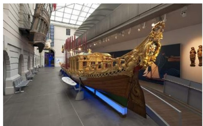
Prince Frederick's Barge