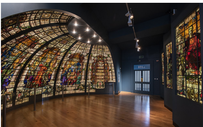
Baltic Exchange Memorial Glass