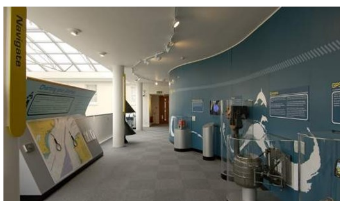
You can play on the Bridge on level 1