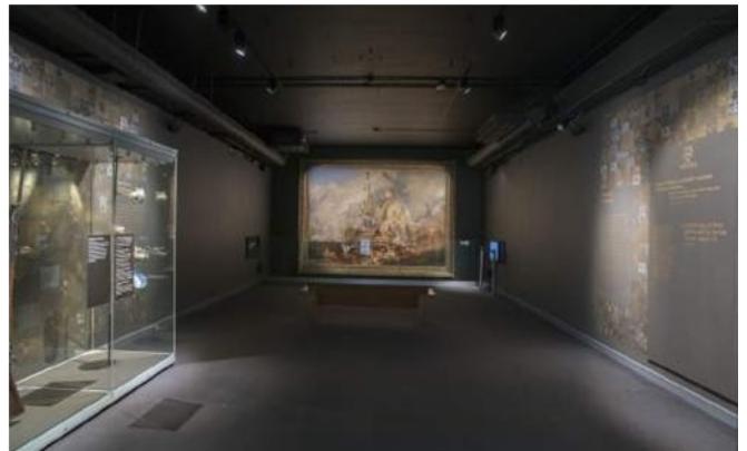
The Turner gallery