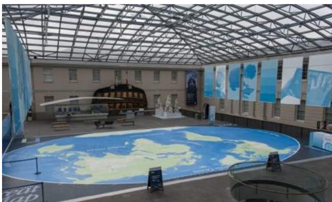
You can play on the Great Map on level 1