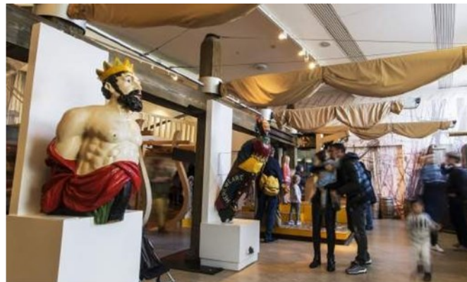
You can play in the All Hands gallery on level 2