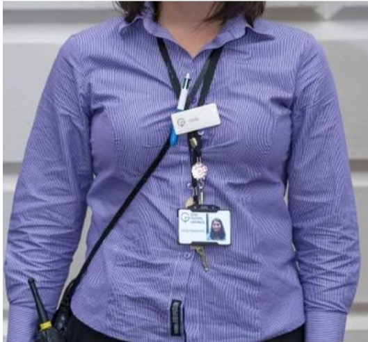
Someone in a purple shirt

If you need help from a member of staff you can look for: