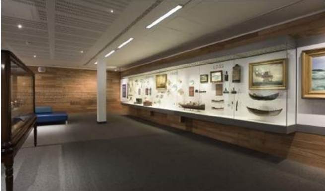
The Voyagers gallery

On the ground floor of the Museum you can see: