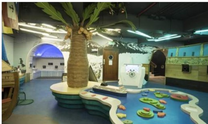
You can play in the AHOY gallery on the Ground Floor

At the National Maritime Museum, you can play: