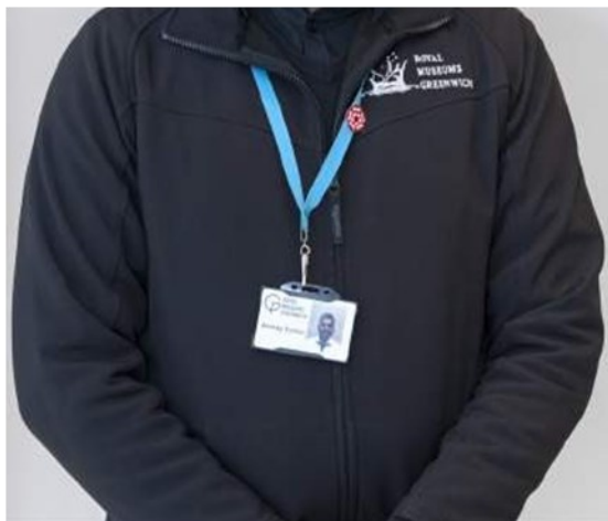
Someone in a black shirt