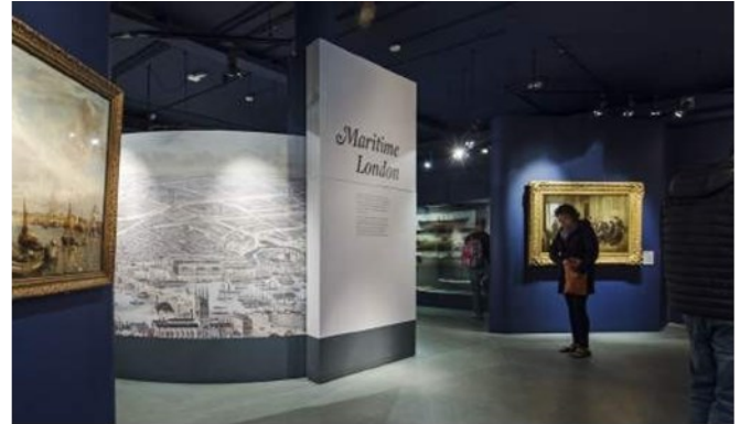
The Maritime London gallery