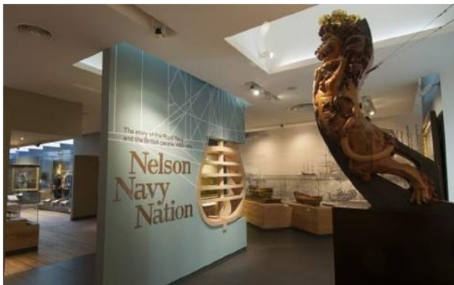
Nelson, Navy, Nation