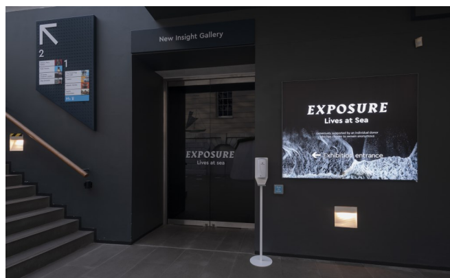
Exposure: Lives at Sea