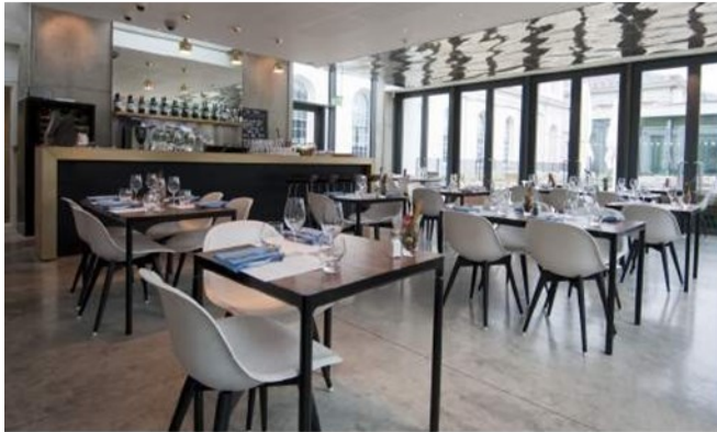
You can eat in the Terrace Café on level 1.