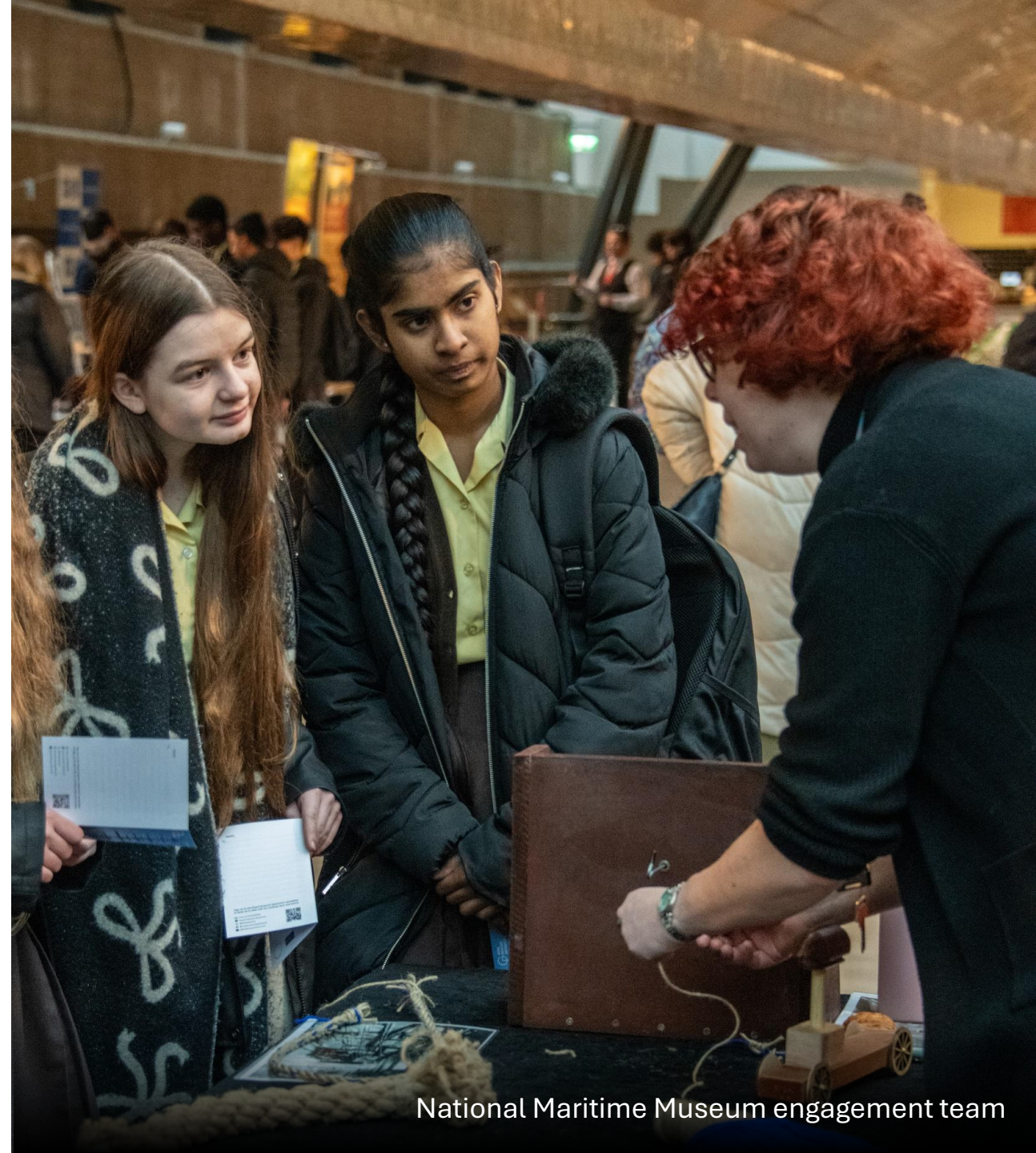
National Maritime Museum engagement team

"This experience increased my love for science"