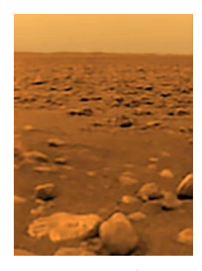
Color view of Titan's surface, captured by the Huygens probe after landing in January 2005.

For example – if I chose Titan, I might want the following images to explain why Titan is so interesting: