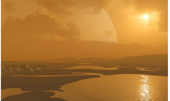
Artist's impression of Titan's surface and atmosphere. (Credit: Benjamin de Bivort, debivort.org / CC BY-SA 3.0)