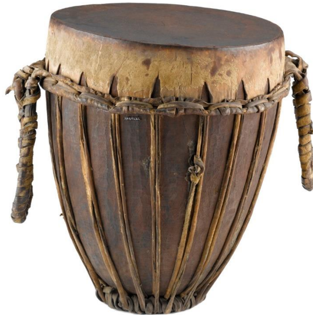
Single Head Drum from West Africa, made around 1894

Look at the object below. Read each question and choose one answer.