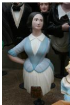
Florence Nightingale A famous nurse