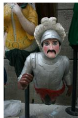
Sir Lancelot A legendary knight