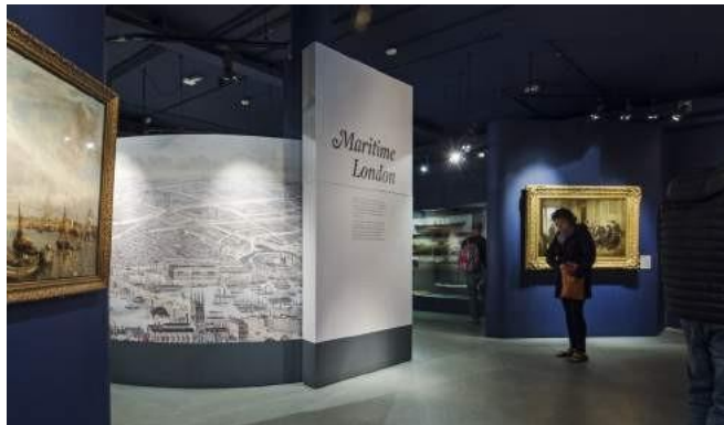
The Maritime London gallery