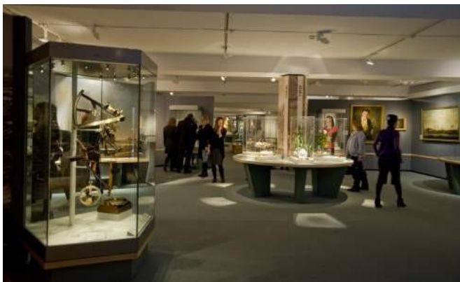
The Atlantic gallery