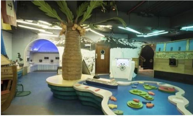
I can play in the AHOY gallery