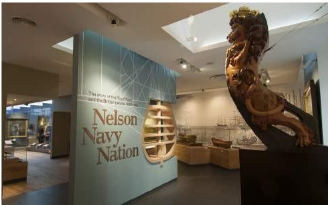
The Nelson, Navy, Nation gallery