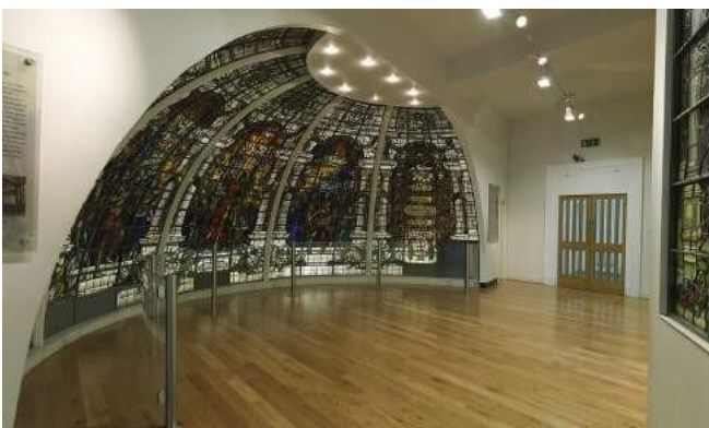
Baltic Exchange Memorial Glass