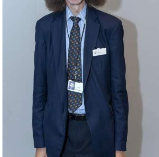
Someone in blue