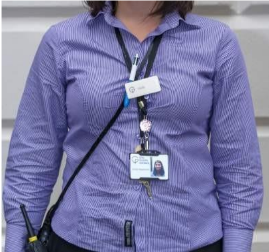
Someone in purple

If I need help from a member of staff I can look for: