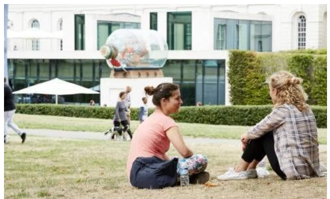
I can eat in the park