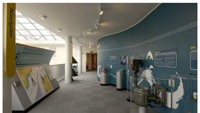
I can play on the Bridge