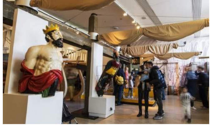
I can play in the All Hands gallery