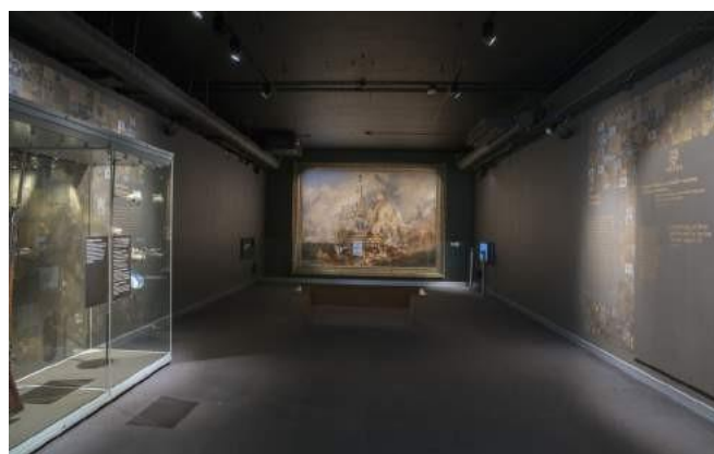
The Turner gallery