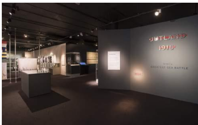
The Jutland gallery