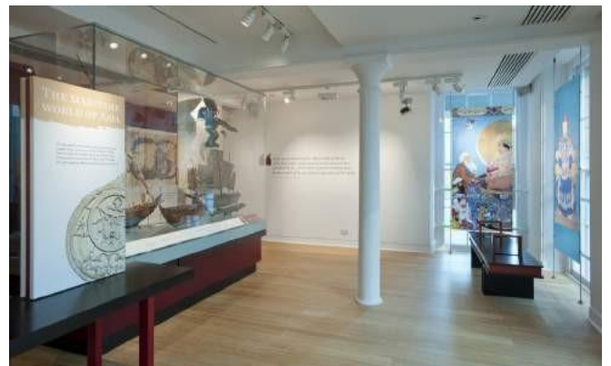
The Traders gallery