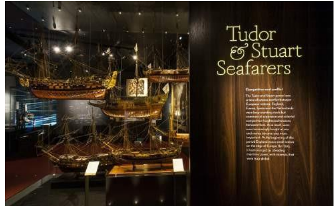
Tudor and Stuart Seafarers