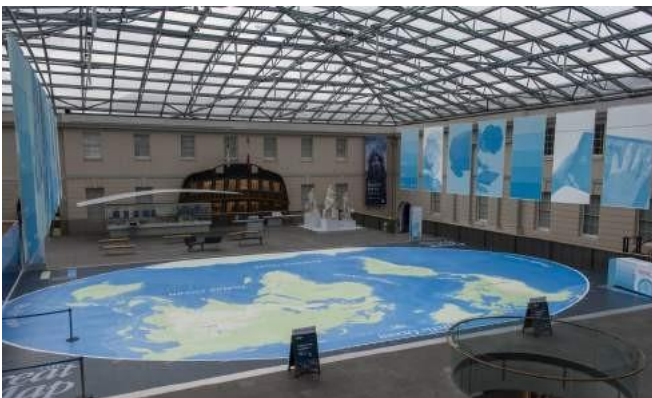
I can play on the Great Map