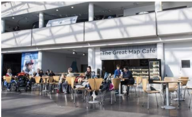
I can eat in the Great Map café