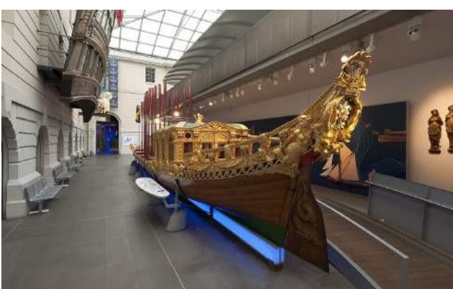
Prince Frederick's Barge