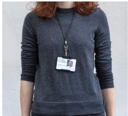
Everyone who works at the Museum wears a badge!