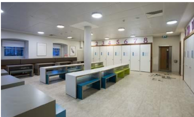
I can eat my packed lunch in the Group Space by the Romney Road entrance.