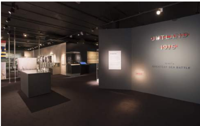
The Jutland gallery