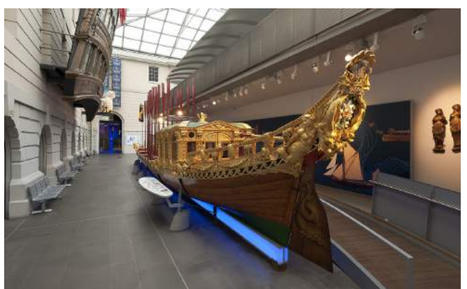
Prince Frederick's Barge