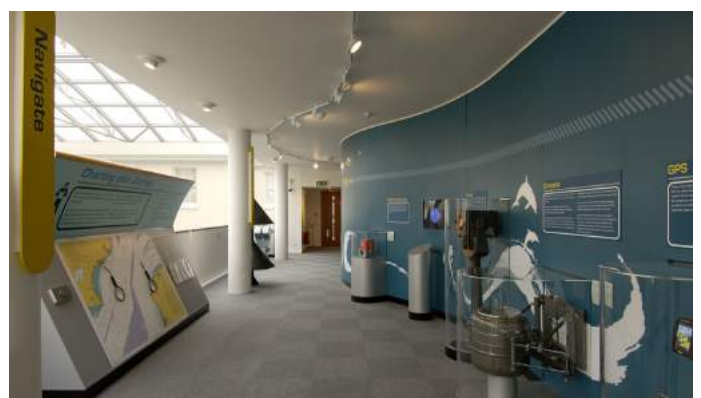
I can play on the Bridge