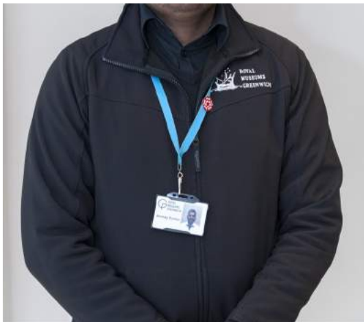
Someone in black