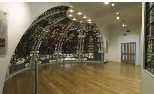
Baltic Exchange Memorial Glass