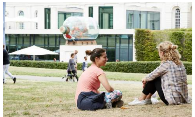
I can eat in the park