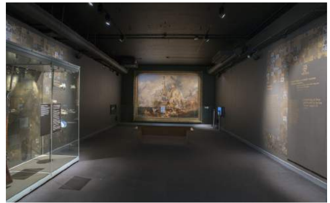
The Turner gallery