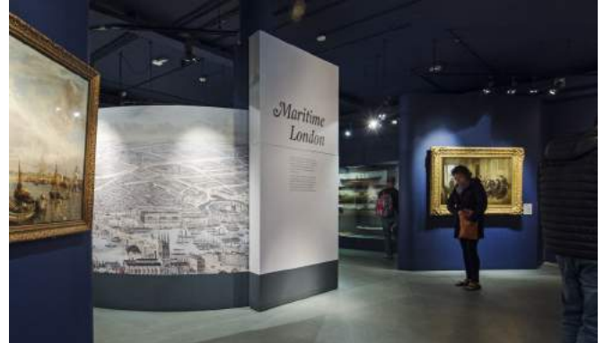
The Maritime London gallery