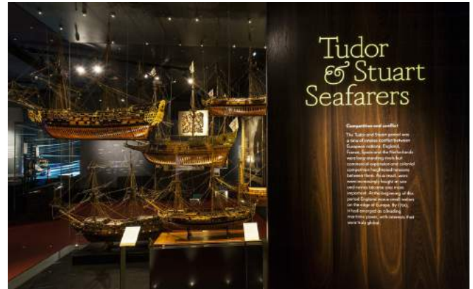
Tudor and Stuart Seafarers