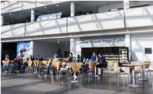
I can eat in the Great Map café