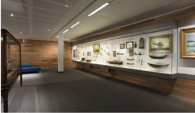
The Voyagers gallery