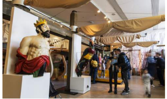
I can play in the All Hands gallery